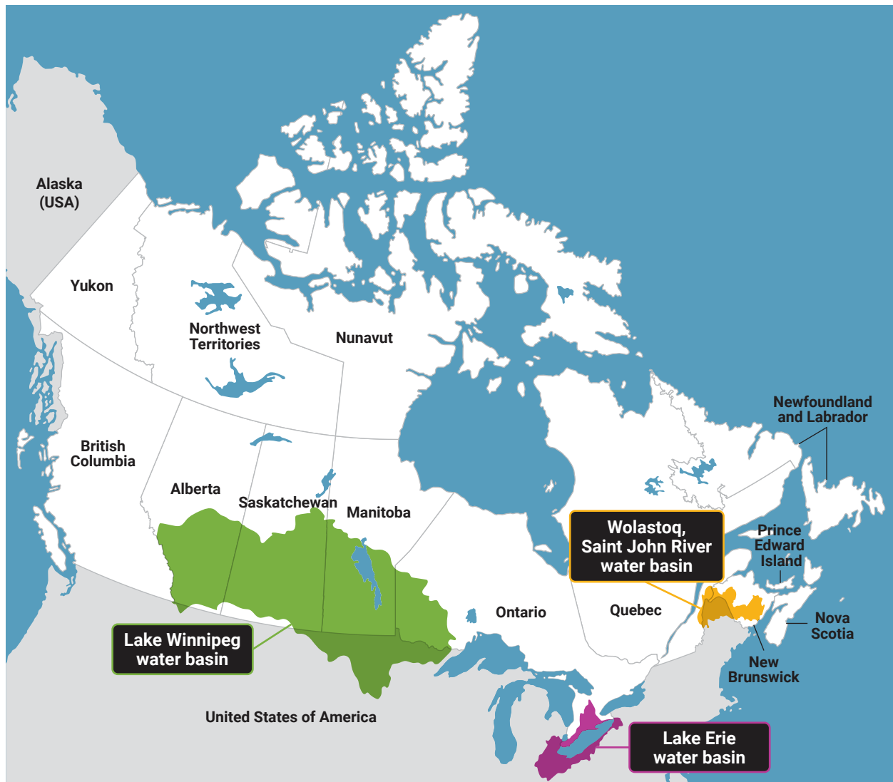
Exhibit 3.2—The 3 water basins examined in this audit