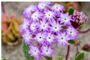
Pink sand-verbena

2.44 Parks Canada published 7 reports on the implementation of the recovery strategies for 6 wildlife species at risk that it was the lead for and 4 reports on related action plans. Six of the 7 reports on the implementation of recovery strategies were published after the 5-year period required by the act. However, each report covered the period from the original posting of the recovery strategy. For 2 species—the Banff Springs snail and the pink sand-verbena—the